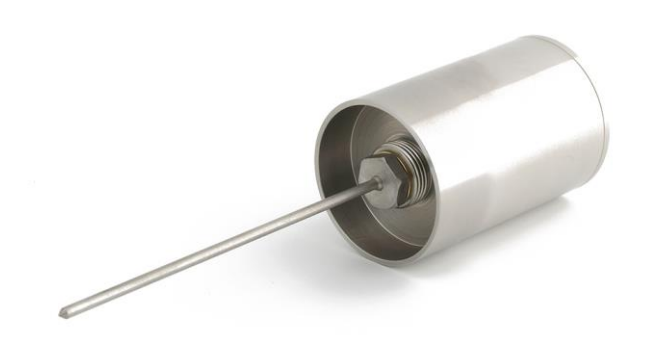
Figure 2 TNS02: Thermal needle TP07 with insertion tool IT03 for laboratory analysis of soil specimns. TP09 and lance LN02 are used for on-site measurements.

Copyright by Hukseflux. Version 1704. We reserve the right to change specifications without prior notice Page 1/2. For Hukseflux Thermal Sensors go to www.hukseflux.com or e-mail us: info@hukseflux.com