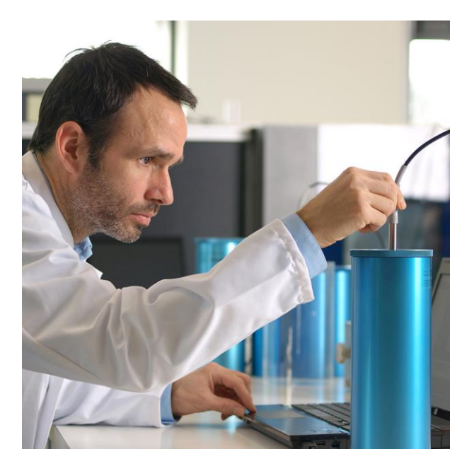
Figure 5 A calibration reference cylinder type CRC05 for needle calibration. The CRC05 is not included in the standard TNS02. For TNS02 two cylinders are required: CRC04 and CRC05.