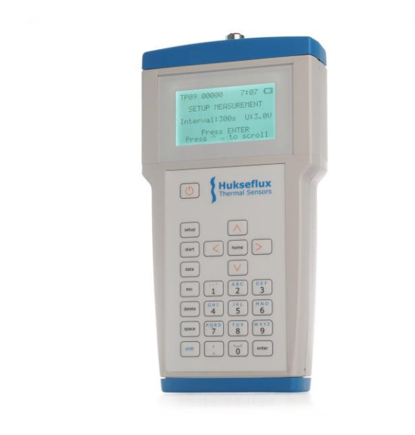
Figure 3 TNS02: CRU02 allows users to control the measurement using the keyboard and LCD display. Results are stored in CRU02's memory.