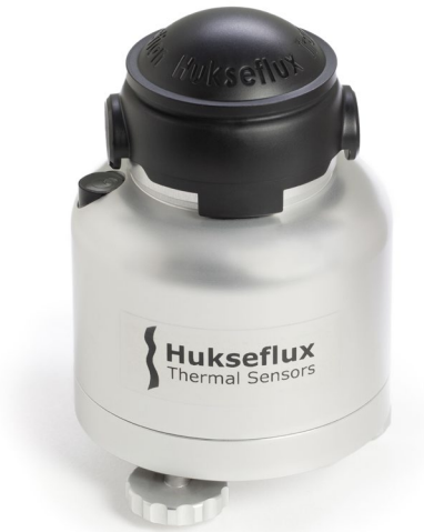
Figure 3 Pyranometer model SR30, with DP01.

The DP01 is specially designed for SR15 and SR30 pyranometers. To keep the DP01 and the sunscreen together during transport, the sunscreen can be installed on top of the DP01. Check if DP01 is installed correctly by pulling it gently, before installing the sunscreen on top.