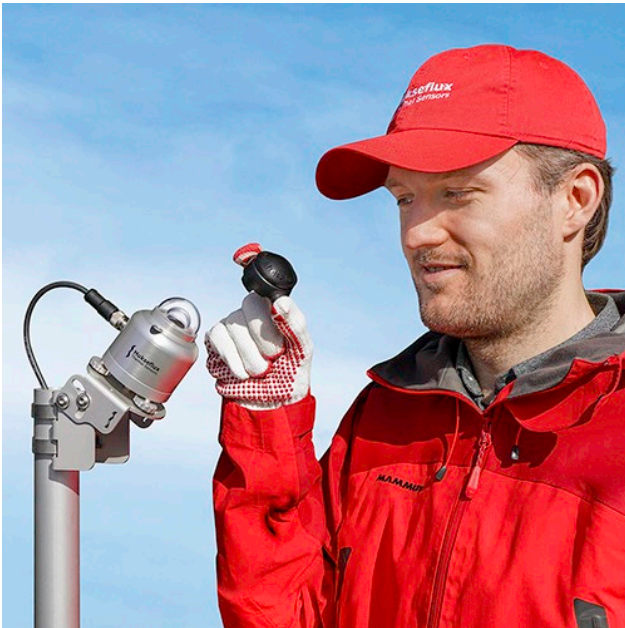
Figure 1 SR30 with DP01 dome protector.

DP01 protects the dome of the pyranometer during transport, installation and removal. Its purpose is to reduce the risk of accidental damage to the pyranometer domes. Our service records show that replacement of scratched and broken domes are a significant contributor to the total cost of ownership. Protecting the pyranometer dome reduces unnecessary repair costs.