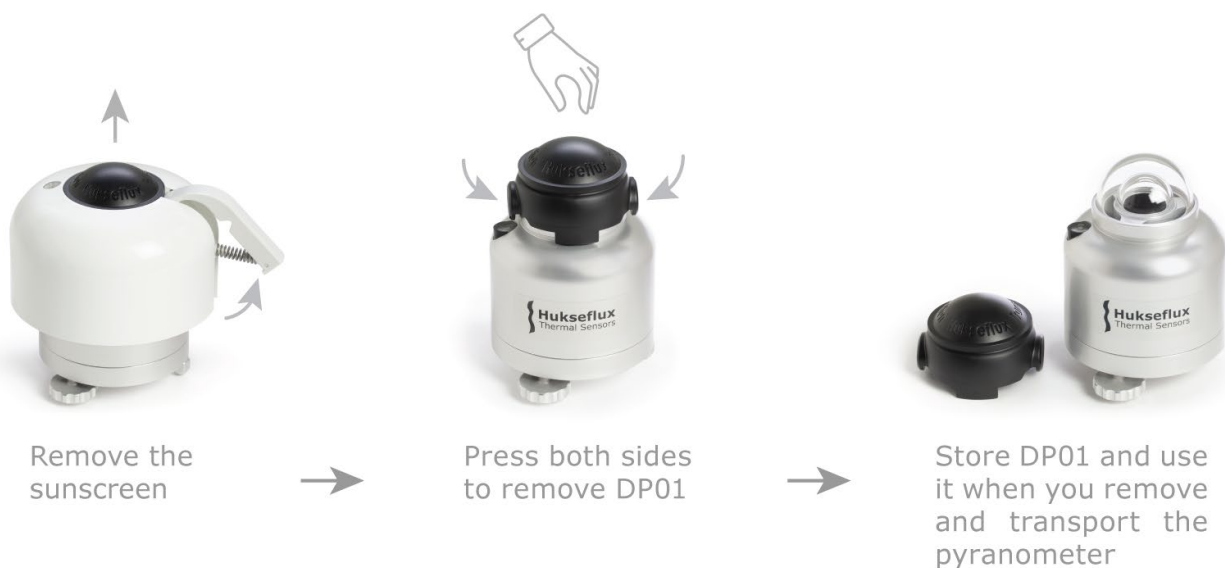
Figure 2 Removal of sunscreen and DP01.

We recommend to keep DP01 on the pyranometer whenever the dome could potentially make contact with a hard object. Please do not forget to remove DP01 before you start measuring.