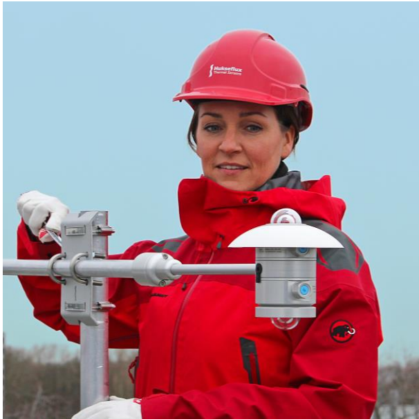
Figure 4 an albedometer being installed with its rod mounted securely to a mast thanks to ALF01 levelling fixture and CMF01 crossarm mounting fixture

CMF01 is made of high-quality metals, allowing installations in all climates and weather conditions. It is delivered with u-bolts and tube clamps. The user should provide his own crossarm and instrument(s). The latter can be ordered separately at Hukseflux.