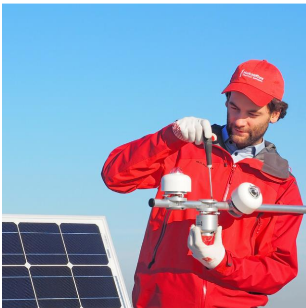
Figure 2 a crossarm can be used for easy installation of a pyranometer, in this case SR30, in Plane of Array, horizontal or inverted for PV system performance monitoring