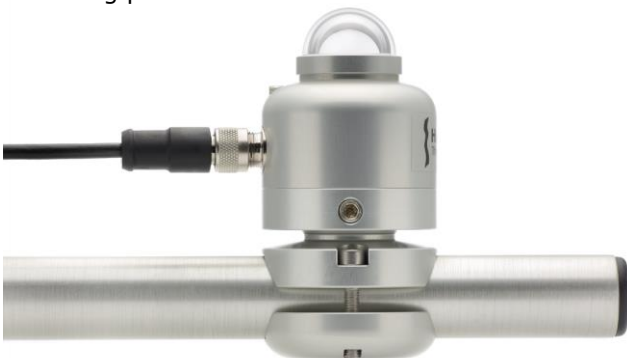
Figure 5 complementary mounting options

There are other Hukseflux mounting options available for SR30, SR15 and SR05 pyranometers. They allow for simplified mounting, levelling and instrument exchange on a flat surface or a tube, such as a crossarm. These mounts are optional with the purchase of these instruments. Alternatively, PMF01 brackets may be used for mounting any Hukseflux pyranometer on a mast, crossarm or other mounting platform.