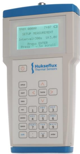
Figure 3 TNS02: CRU02 allows users to control the measurement using the keyboard and LCD display. Results are stored in CRU02's memory.