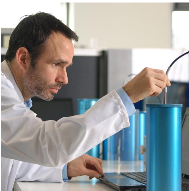
Figure 5 A calibration reference cylinder type CRC05 for needle calibration. The CRC05 is not included in the standard TNS02. For TNS02 two cylinders are required: CRC04 and CRC05.