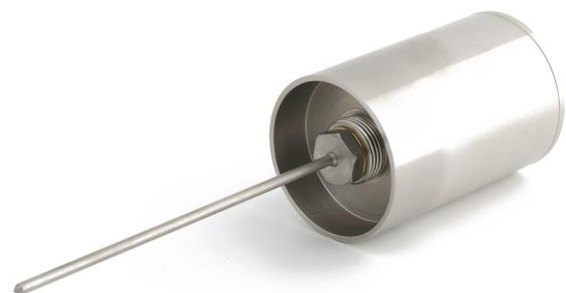
Figure 2 TNS02: Thermal needle TP07 with insertion tool IT03 for laboratory analysis of soil specimens. TP09 and lance LN02 are used for on-site measurements.