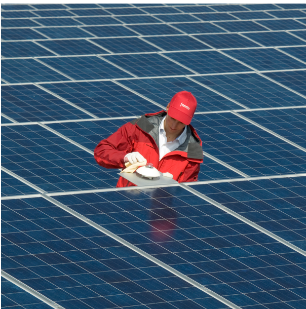
Figure 2 accurate PV system performance monitoring