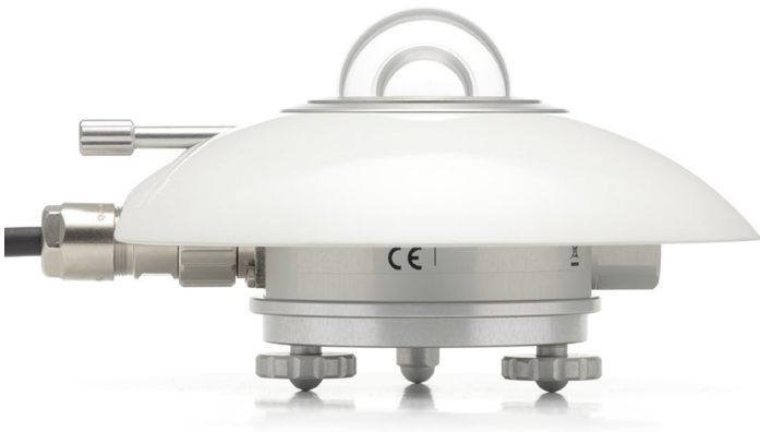
Figure 1 SR20 secondary standard pyranometer