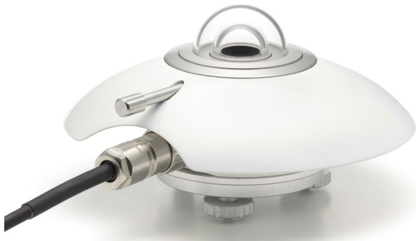
Figure 6 SR20 pyranometer side view

SR20's low temperature dependence makes it an ideal candidate for use under very cold and very hot conditions. The temperature dependence of every individual instrument is tested and supplied as a second degree polynomial. This information can be used for further reduction of temperature dependence during post-processing.