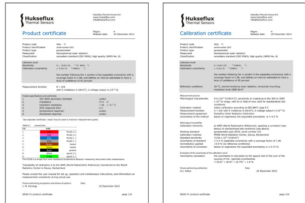
Figure 4 Hukseflux product and calibration certificate

The ISO/ IEC Guide 99:2007 International Vocabulary of Metrology states that “type B evaluation of measurement uncertainty may be evaluated based on information obtained from the accuracy class of a verified measuring instrument” [1]. The ISO 9060:1990 standard, which covers pyranometer classification, demands for secondary standard pyranometers that “all specifications are tested for every individual instrument” [2]. In practice, the leading manufacturers of pyranometers test their secondary standard instruments, but not all supply these instruments with test certificates for the most critical specifications. These critical specifications are temperature dependence (this should be at least up to +50 °C for PV applications) and directional response (this should be up to 80 ° zenith angle in the extreme east and west directions for PV applications). Having the right certificates matters. By having these, you avoid any issues of liability.