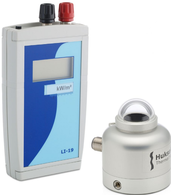
Figure 1 SR05-A1 pyranometer with LI19 handheld read-out unit / datalogger.

SR05 is a solar radiation sensor that is applied in most common solar radiation observations. SR05-A1, with analogue millivolt output, complies with the spectrally flat Class C specifications of the ISO 9060 standard and the WMO Guide. LI19 is a high-accuracy handheld read-out unit / datalogger. The SR05-LI19 combination is well suited for mobile measurements and short term datalogging.