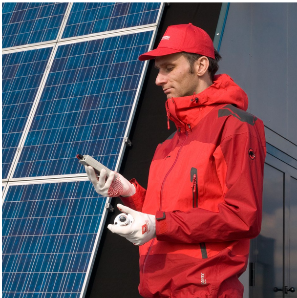
Figure 4 LI19 used with a pyranometer in a field measurement campaign.