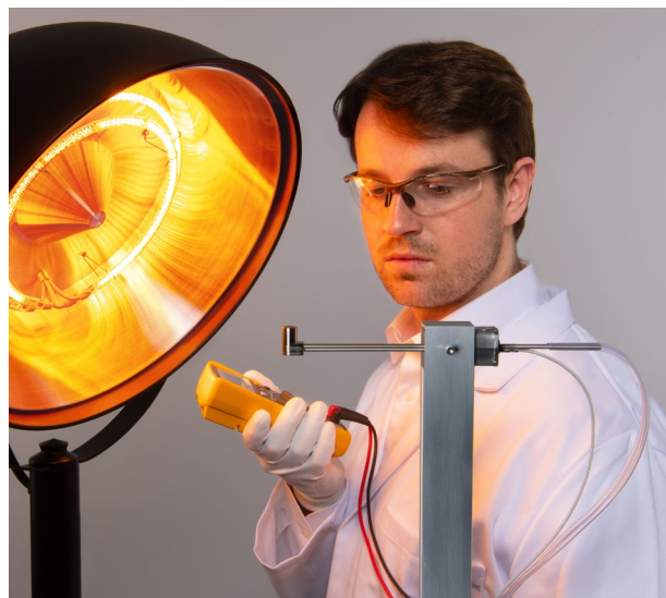
Figure 2 SBG04 is the sensor of choice for cone calorimeter calibration.

The ISO 5660 standard has 4 parts: Part 1: Heat release rate (cone calorimeter method).