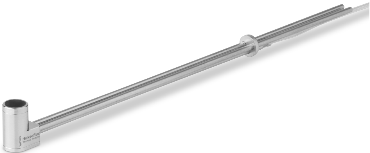
Figure 1 SBG04 water-cooled heat flux sensor.

SBG04 is a water-cooled sensor that measures heat flux. SBG04 is mainly used as a calibration reference standard for testing with cone calorimeters. All specifications and dimensions are standardised for use in cone calorimeters according to ISO 5660 and ASTM E1354 reaction-to-fire tests. The design includes two water cooling tubes fixed at a 90° angle to the sensor body, with a sensor body of a 0.5 inch diameter. The sensor may also be used in flammability, fire resistance, and smoke chamber testing. For other water-cooled heat flux sensors, see the SBG01 and GG01 sensors.