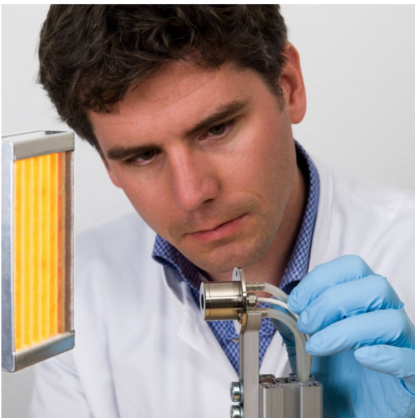
Figure 2 SBG01 is the sensor of choice for fire testing.