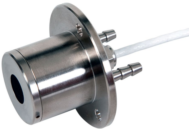
Figure 1 SBG01 water cooled heat flux sensor.

SBG01 is a water-cooled sensor that measures heat flux. Introduced in 2008, SBG01 has rapidly become the sensor of choice for fire testing. SBG01 is mainly used to test reaction to fire and fire resistance. It is also used as a calibration reference standard for test equipment, for example in flammability and smoke chamber tests. SBG01 complies with the requirements of the most common ASTM and ISO standard test methods.