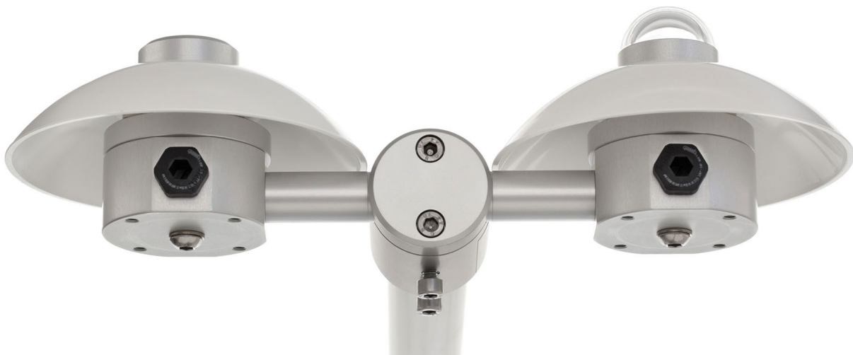
Figure 1 RA01 2-component radiometer.

RA01 is a market leading 2-component radiometer, mostly used in scientific-grade energy balance and surface flux networks. It offers 2 separate measurements of solar and longwave radiation with a pyranometer and a pyrgeometer. Product features include a modular design, low weight, and easy levelling, and low solar offsets in the longwave measurement. The unique capability to heat the pyrgeometer reduces measurement errors caused by dew deposition. When combined with estimates of solar albedo and of local surface temperature, this instrument can also be used for estimation of net radiation. The advantages of this approach are cost reduction and independence from local surface properties.