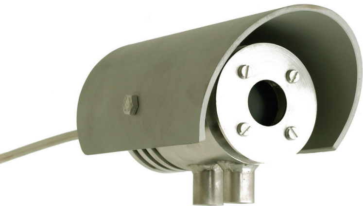
Figure 1 HF02 flare radiation monitor / heat flux sensor

HF02 is a sensor that measures radiant heat flux or thermal radiation in the outdoor environment. A common application is monitoring the radiation emitted by flares. HF02 is certified for use in potentially explosive atmospheres, and is rated for radiation levels up to 15 \times 10^3 \text{ W/m}^2 . We recommend use of HF02 in a decision-supporting role only, and not to use measurements of HF02 as the main or sole source of information for judging safety.