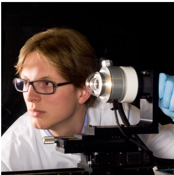
Figure 2 Directional response testing at Hukseflux