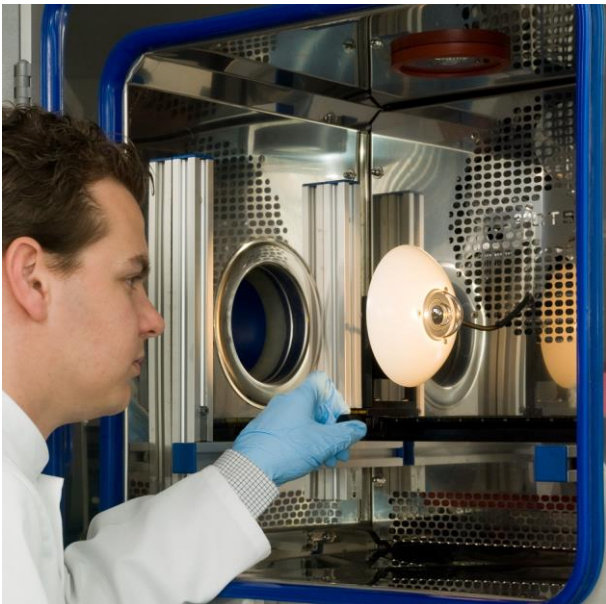
Figure 6 Temperature response testing at Hukseflux