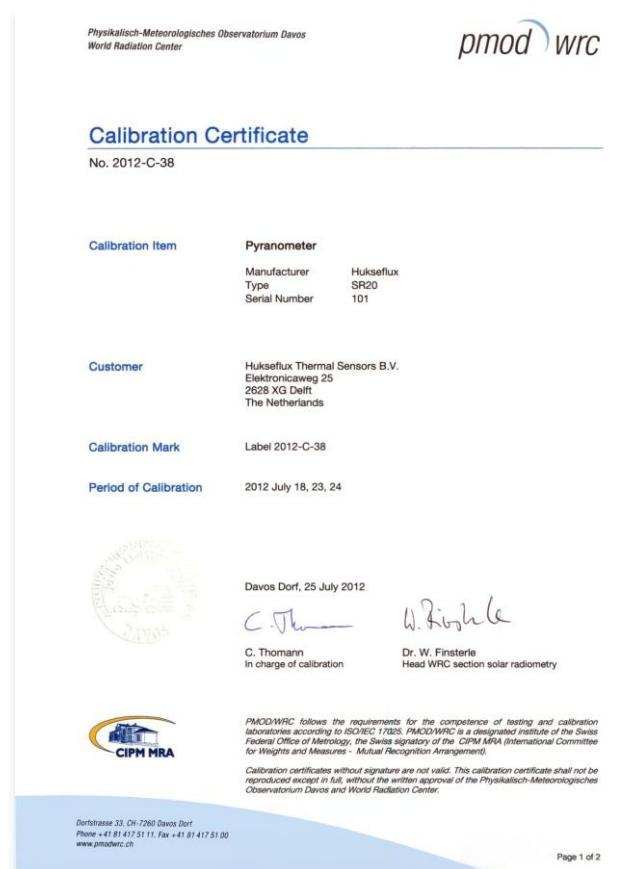
Figure 4 PMOD certificate of SR20