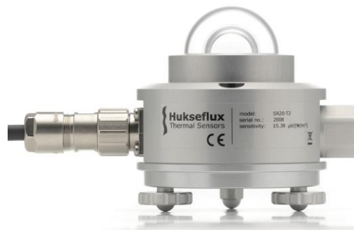
Figure 7 SR20 pyranometer with its sun screen removed

Whatever your application is, Hukseflux offers the highest accuracy in every class at the most attractive price level.