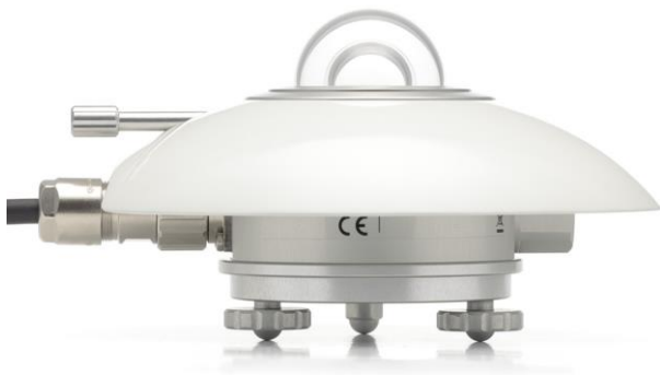
Figure 1 SR20 spectrally flat Class A pyranometer

Hukseflux invested more than 10 man-years in developing the infrastructure to manufacture, test and calibrate a spectrally flat Class A pyranometer. These efforts resulted in the SR20 Class A pyranometer, released February 2013.