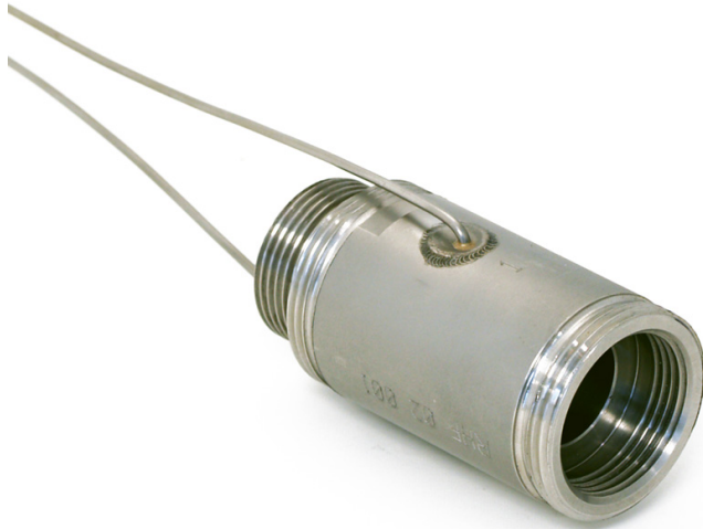
Figure 0.1 Example of a customer-specific RHF ring heat flux sensor with 2 x heat flux and temperature sensor, also showing high temperature cables

RHF is most suitable for relative measurements using one sensor, i.e. monitoring of trends relative to a certain reference point in time or comparing heat flux at one location to the heat flux at another location. The heat flux sensor calibration depends on the way the sensors are built-in and may also depend on the flow rate of the gas or liquid used for cooling. RHF01 is provided with a factory calibration of every sensor which is suitable for relative measurements. If you want to perform accurate absolute measurements with RHF, as opposed to relative measurements, it is necessary to calibrate the RHF incorporated in the final design under operating conditions, possibly as a function of water or air flow. Hukseflux can provide dedicated heaters to perform such calibration.