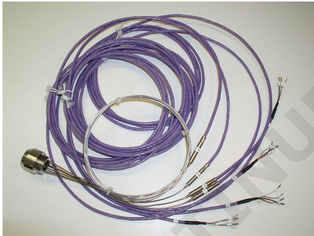
Figure 0.3 Example of a customer-specific RHF ring heat flux sensor; the entire sensor, high temperature cable and low temperature extension cable