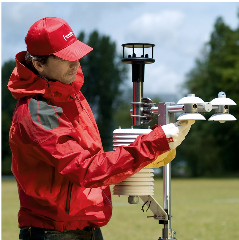
Figure 4.1 typical meteorological surface energy balance measurement system with STP01 installed in the soil

Usually this measurement is combined with measurements of the soil heat flux, soil thermal conductivity and soil heat capacity to estimate the heat flux at the soil surface. Knowing the heat flux at the soil surface, it is possible to "close the balance" and estimate the uncertainty of the measurement of the other (convective and evaporative) fluxes.