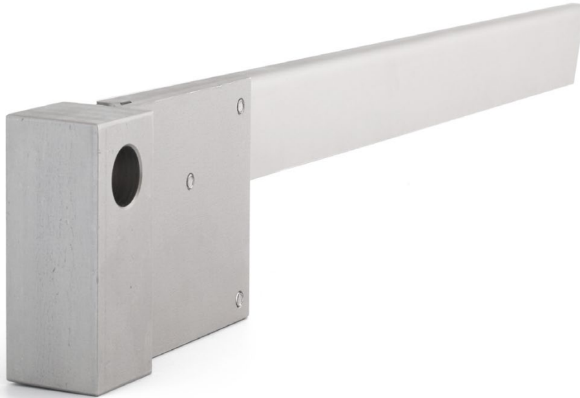
Figure 0.3 IT01 insertion tool is hammered down into the soil. After retracting it leaves a slit in which STP01 may be inserted.