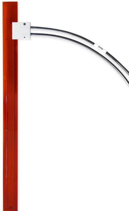
Figure 0.1 STP01. Standard cable length is 5 m.

Equipped with heavy duty cabling, and potted so that moisture does not penetrate the sensor, STP01 has proven to be very robust and stable. It survives long-term installation in soils. For ease of installation with a minimum of disturbance of the local soil, Hukseflux offers IT01 insertion tool.