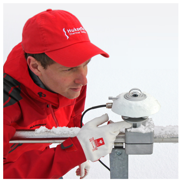
Figure 4 SR25 accelerating sublimation of snow, here shortly after snowfall

SR25 has a sapphire outer dome, glass inner dome and an internal heater. It employs a stateof-the-art thermopile sensor with black coated surface and an anodised aluminium body. The connector, desiccant holder and sun screen fixation are very robust and designed for long term use.