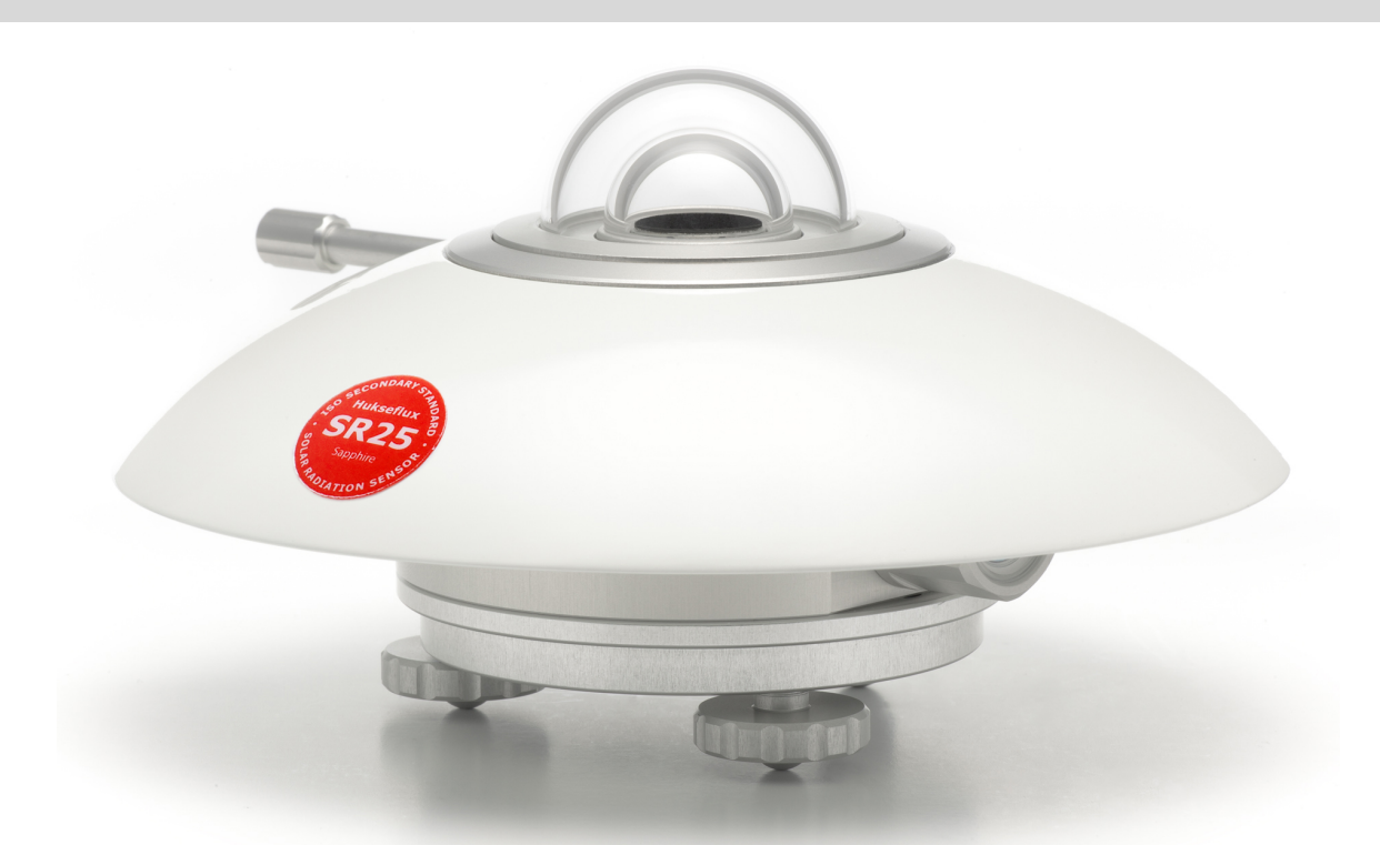
Figure 1 SR25 secondary standard pyranometer

SR25 takes solar radiation measurement to the next level. Using a sapphire outer dome, it has negligible zero offsets. SR25 is heated in order to suppress dew and frost deposition, maintaining its measurement accuracy. When heating SR25, the data availability and accuracy are higher than when ventilating traditional pyranometers. SR25 needs very low power. SR25 is an excellent reference for diffuse radiation.