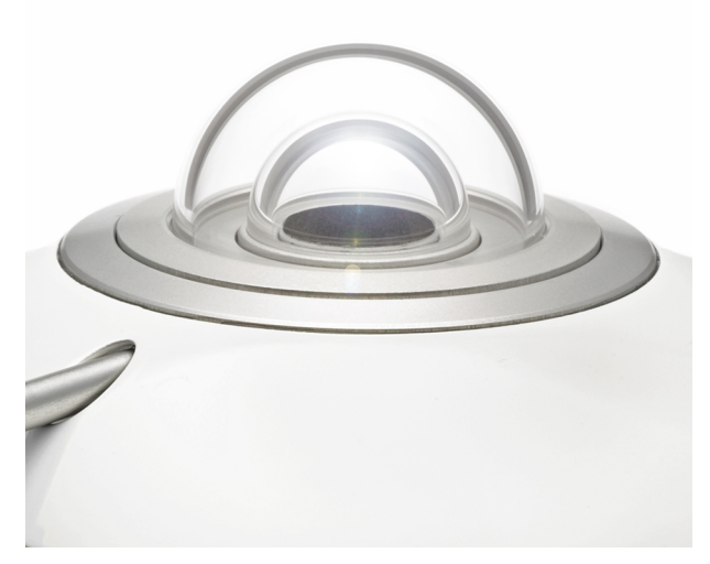
Figure 6 SR25's sapphire outer dome takes solar radiation measurement to the next level