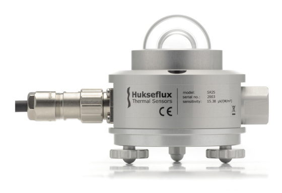
Figure 3 SR25 pyranometer with its sun screen removed

SR25 measures the solar radiation received by a plane surface, in W/m<sup>2</sup>, from a 180° field of view angle. SR25 offers the best measurement accuracy: the specification limits of two major sources of measurement uncertainty have been greatly improved over competing pyranometers: "zero offset a" and temperature response.