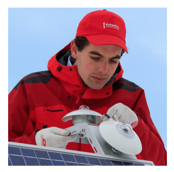
Figure 2 dual setup in PV system performance monitoring