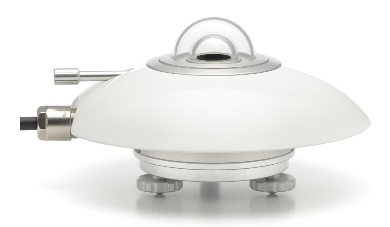
Figure 1 SR20 secondary standard pyranometer

SR20 is a solar radiation sensor of the highest category in the ISO 9060 classification system: secondary standard. SR20 pyranometer should be used where the highest measurement accuracy is required.