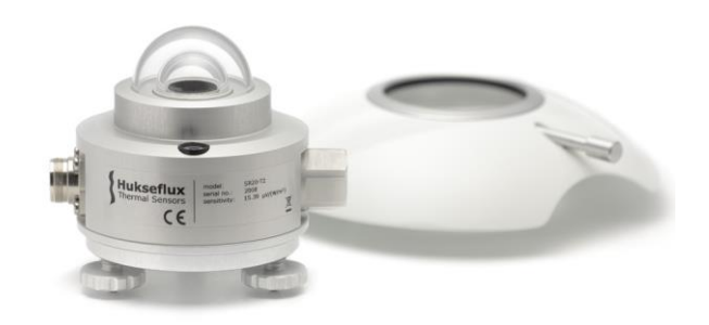
Figure 4 SR20 with its sun screen removed

The uncertainty of a measurement under outdoor conditions depends on many factors. Guidelines for uncertainty evaluation according to the "Guide to Expression of Uncertainty in Measurement" (GUM) can be found in our manuals. We provide spreadsheets to assist in the process of uncertainty evaluation of your measurement.