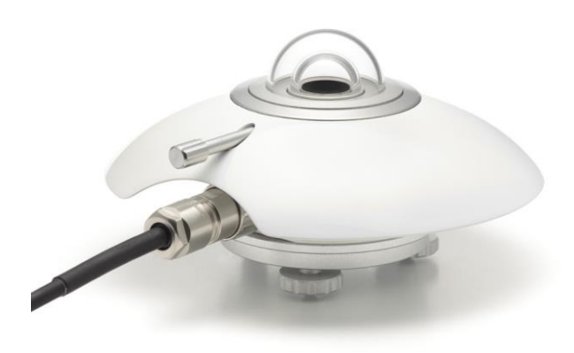
Figure 5 SR20 side view