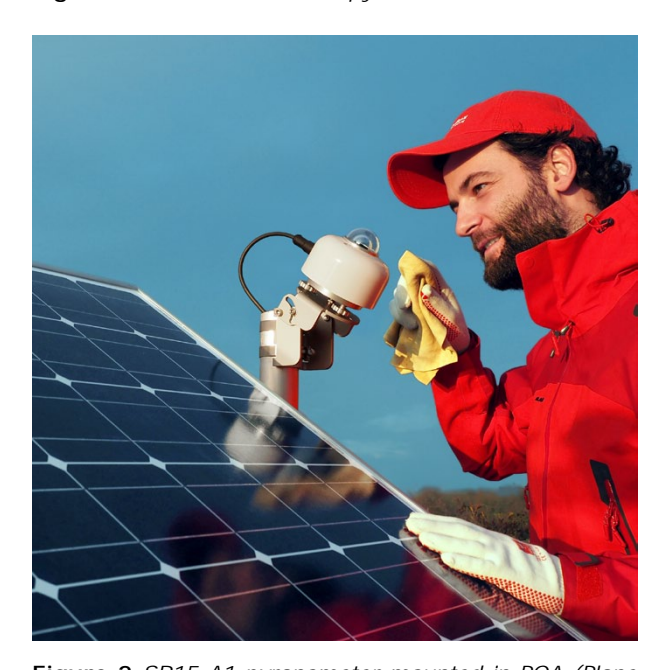
Figure 2 SR15-A1 pyranometer mounted in POA (Plane Of Array) on a mast for PV performance monitoring