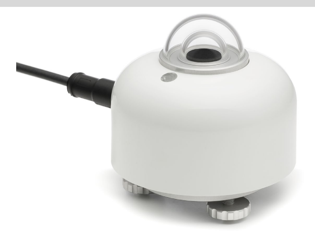
Figure 1 SR15-A1 first class pyranometer with heater

SR15-A1 is a high-accuracy solar radiation sensor. It is first class according to the WMO guide and ISO 9060:1990 standard and "Spectrally Flat Class B" in the 2018 revision. With its on-board heater, it is compliant in its standard configuration with the requirements for "Class B" PV monitoring systems of the new IEC 61724-1:2017 standard.