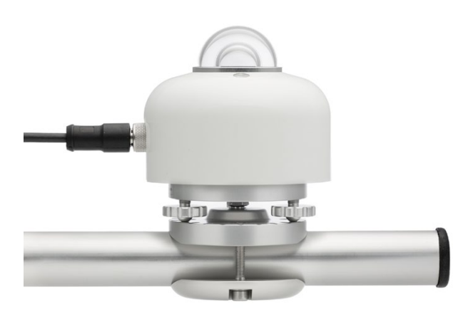
Figure 5 SR15-A1 with optional tube levelling mount