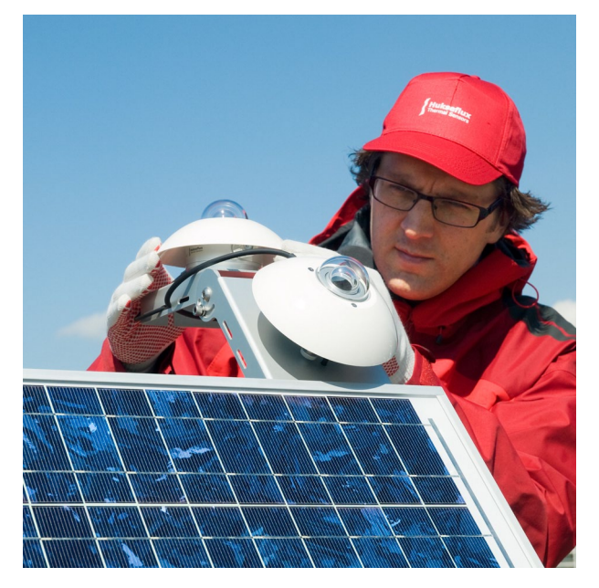
Figure 2 PV system performance monitoring pyranometers