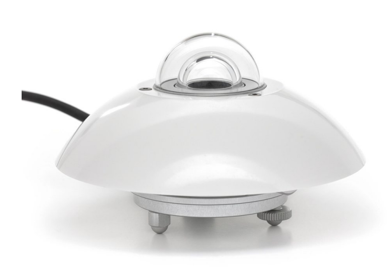
Figure 1 SR12 first class pyranometer for solar energy test applications

SR12 is a high accuracy solar radiation sensor that meets and exceeds the ISO 9060 standard performance mandate for first class pyranometers for "solar energy test applications". It is the preferred instrument for PV system performance monitoring. An internal temperature sensor and a heater are features of SR12 pyranometer; its directional response is tested and reported for every individual instrument.