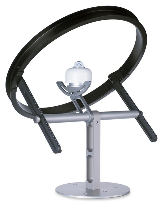
Figure 1 SHR02 shadow ring for pyranometers (a pyranometer is not included in SHR02 delivery)

SHR02 is a shadow ring, used in combination with a pyranometer to form a "diffusometer". The ring will prevent direct radiation from reaching the pyranometer from sunrise to sunset, so that the shaded pyranometer measures diffuse radiation only. SHR02 is used with Hukseflux pyranometers such as SR30 and SR20. These models have very low zero offsets, leading to higher accuracy diffuse measurements than attained with competing models.