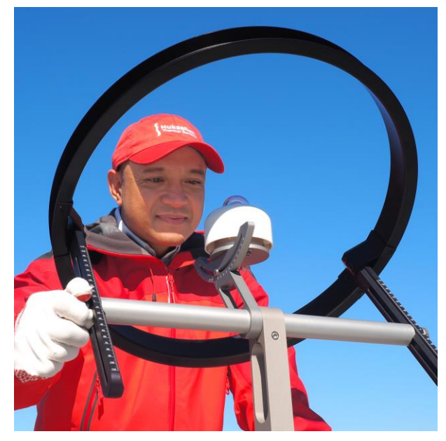
Figure 2 installation of the compact SHR02 shadow ring and a Hukseflux pyranometer is easy. When combined, a diffusometer is created, in which the shaded pyranometer measures diffuse radiation only.