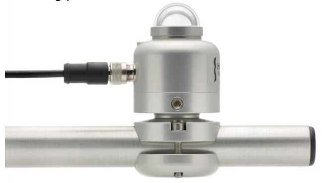
Figure 5 complementary mounting options

There are other Hukseflux mounting options available for SR30, SR15 and SR05 pyranometers. They allow for simplified mounting, levelling and instrument exchange on a flat surface or a tube, such as a crossarm. These mounts are optional with the purchase of these instruments. Alternatively, PMF01 brackets may be used for mounting any Hukseflux pyranometer on a mast, crossarm or other mounting platform.