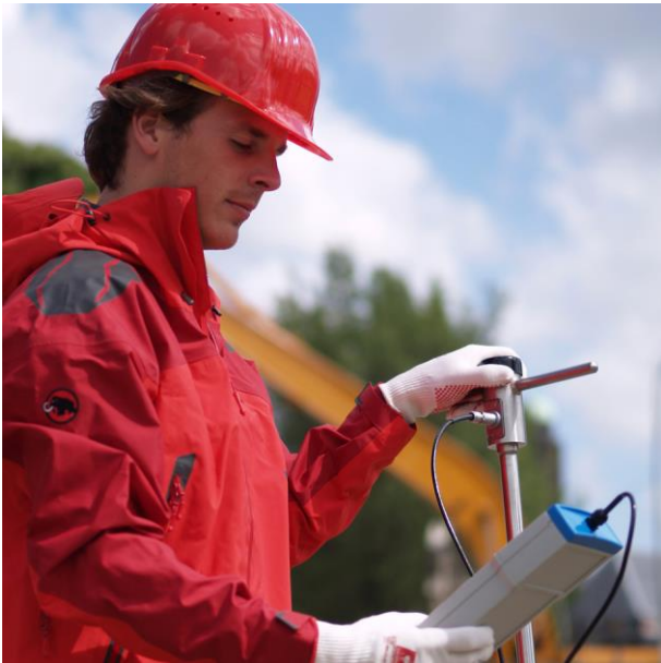
Figure 1 Example of an application of Hukseflux thermal conductivity measuring systems: thermal route survey

Hukseflux is a leading manufacturer of thermal conductivity measuring systems and sensors. This brochure offers general guidelines for choosing the right system or sensor for your application. Cannot find what you are looking for? Ask us for alternatives. Hukseflux also offers material characterisation testing services as well as engineering and consultancy services.