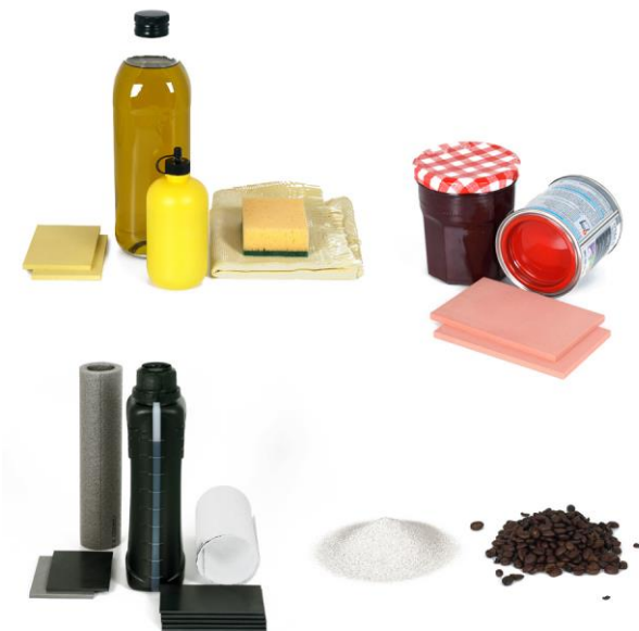
Figure 2 Example of materials of which thermal properties can be determined with Hukseflux measuring systems and sensors: common samples are plastics, paints, composites, pastes and fluids

Hukseflux is able to offer highest quality products at an acceptable price level. If we cannot offer you an acceptable solution ourselves, we will tell you who can. Please contact us for further assistance.