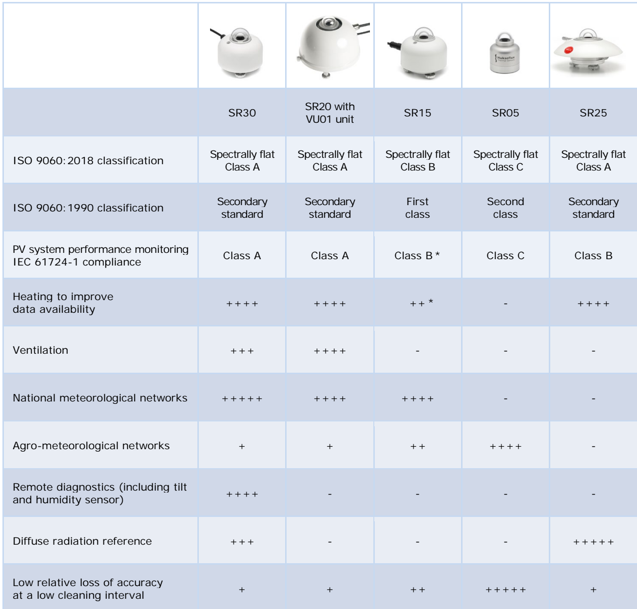
Table 1 The most common considerations when choosing a pyranometer for PV system performance monitoring application

Table 1 gives an overview of pyranometers and the most common considerations for choosing a particular one.