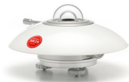
SR25 PYRANOMETER Secondary standard pyranometer with sapphire outer dome