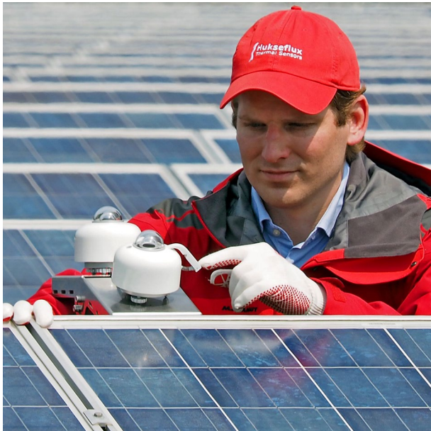
Figure 1 SR30 pyranometers, our most popular solution for PV system performance monitoring according to IEC 61724-1 class A

Hukseflux offers a wide range of solutions for measurement of solar radiation. This brochure offers you general guidelines for selection of the right instrument. The application of pyranometers in PV system performance monitoring according to IEC 61724-1 is highlighted as an example. Sensors specific for diffuse radiation and meteorological networks are also addressed in this selection guide.