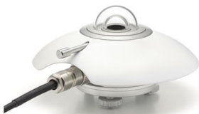
SR20 PYRANOMETER Secondary standard pyranometer