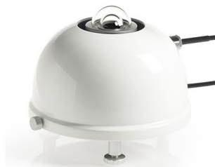
VU01 VENTILATION UNIT Ventilation unit for SR20