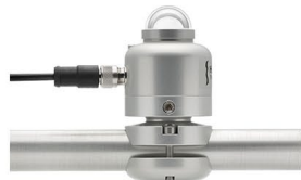
SR05 PYRANOMETER SERIES Second class pyranometers with various outputs