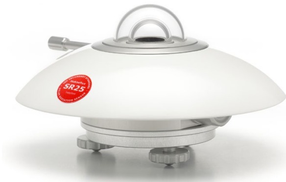
Figure 2 Example of a Hukseflux pyranometer: SR25 secondary standard pyranometer with sapphire outer dome. This model is recommended for research grade diffuse radiation measurement. Output is either analogue millivolt or digital via Modbus RTU over RS-485 and analogue 4-20 mA (current loop).