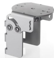
PMF01 Pyranometer mounting fixture PoA