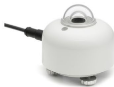
SR15 PYRANOMETER SERIES First class pyranometers with various outputs