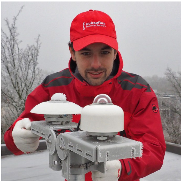
Figure 3 Frost and dew deposition: clear difference between a non-heated pyranometer (back) and SR30 with RVH™ technology (front)

The dome of SR30 pyranometer is heated by ventilating the area between the inner and outer dome. RVH™ is much more efficient than traditional ventilation, where most of the heat is carried away with the ventilation air. Recirculating ventilation is as effective in suppressing dew and frost deposition at 2 W as traditional ventilation is at 10 W. RVH™ technology also leads to a reduction of zero offsets.