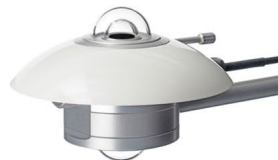
SRA20 ALBEDOMETER Secondary standard albedometer