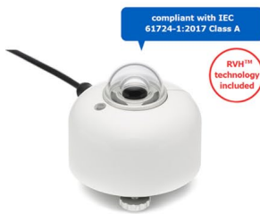
SR30 PYRANOMETER Next level digital secondary standard pyranometer

Need for support in your selection process? E-mail us at: info@hukseflux.com