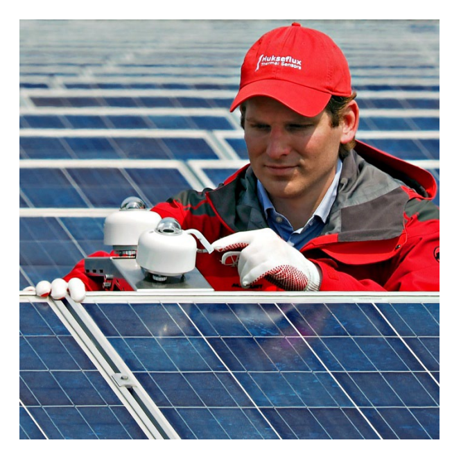
Figure 3 two SR30 secondary standard pyranometers with digital output for GHI (global horizontal irradiance) and POA (plane of array) measurement applications

The dome of SR30 pyranometer is heated by ventilating the area between the inner and outer dome. RVH<sup>™</sup> is much more efficient than traditional ventilation, where most of the heat is carried away with the ventilation air. Recirculating ventilation is as effective in suppressing dew and frost deposition at 2 W as traditional ventilation is at 10 W. RVH<sup>™</sup> technology also leads to a reduction of zero offsets.