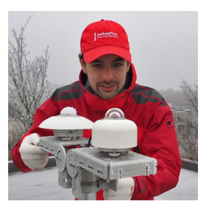
Figure 1 frost and dew deposition: clear difference between a non-heated pyranometer (back) and SR30 with RVH^{TM} - Recirculating Ventilation and Heating - technology (front)

IEC 61724-1:2017 requires pyranometer heating and ventilation for class A, and heating only for class B. Why? Pyranometer domes are made of glass. When facing the sky on a clear night, glass temperature tends to go below dewpoint, so that water condenses on the dome. Heating and ventilation of solar radiation sensors keeps the glass temperature above dewpoint and free from dew and frost deposition. This significantly increases the reliability of the measured data.