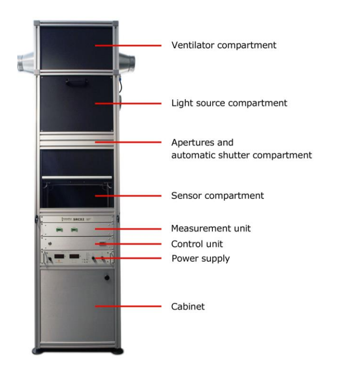
Figure 2 example of a typical test facility designed by Hukseflux: SRC02. 19 inch rack, height 2.4 m. (see also figure 3)