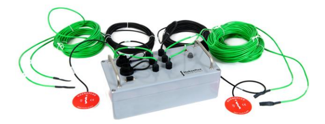
Figure 7 example of a measuring system designed by Hukseflux engineering. Measuring system for analysis of the thermal resistance and the thermal transmittance of building elements by in-situ measurement. TRSYS01 is used for measurements according to ISO 9869 and ASTM C1155 / C1046 standards.