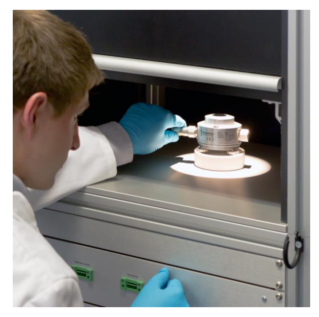
Figure 1 user at work with a typical measuring system supplied by Hukseflux

The next pages show you some example projects carried out by Hukseflux via its engineering and consultancy services and some references.