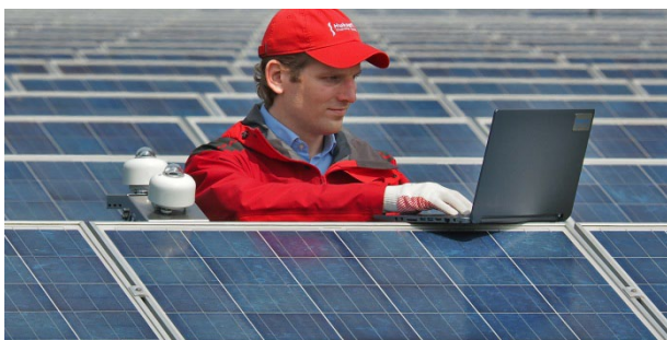
Figure 2 Two SR30 secondary standard pyranometers measuring GHI (Global Horizontal Irradiance) and POA (Plane Of Array) in a PV performance monitoring system